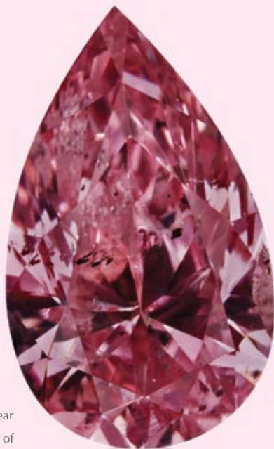
Impressive in rarity and beauty this 0.62ct Pear Shaped Australian Argyle Pink Diamond is one of the stunning jewels from the 2015 Argyle Tender.

It is interesting to note that, since the mine began production in 1984, only 1% of the 600 million diamonds produced from Argyle are pink. With less than six years of production remaining in the Argyle Diamond Mine, Argyle Pink Tender Diamonds are literally one in a million. This imminent extinction has led to a noticeable surge of interest in the world's most sought after gem, the exclusive Pink Diamond.