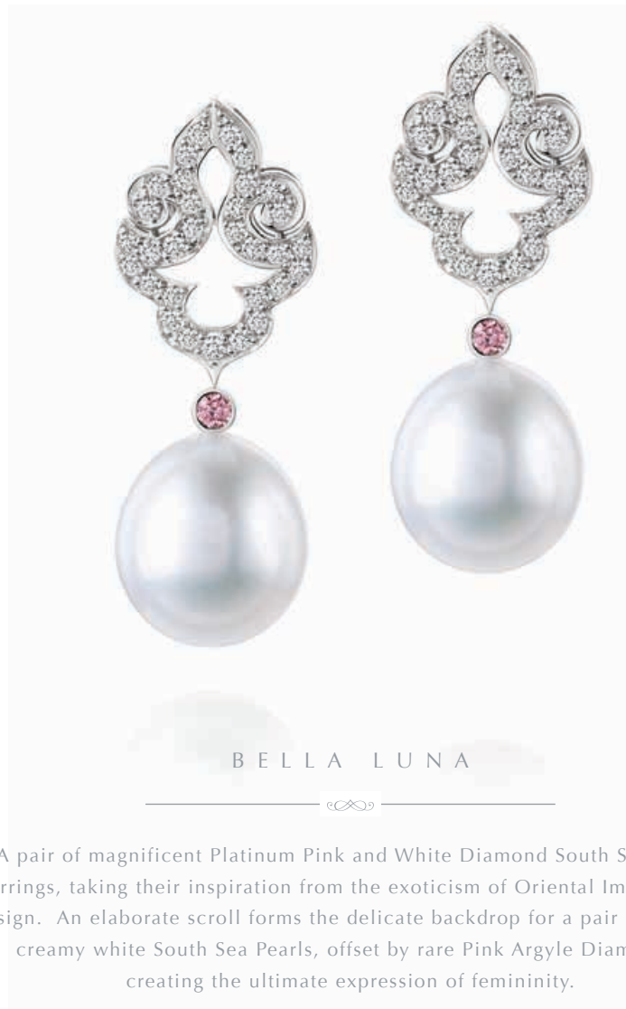
B E L L A L U N A

A pair of magnificent Platinum Pink and White Diamond South Sea Pearl earrings, taking their inspiration from the exoticism of Oriental Imperialistic design. An elaborate scroll forms the delicate backdrop for a pair of lustrous creamy white South Sea Pearls, offset by rare Pink Argyle Diamonds, creating the ultimate expression of femininity.