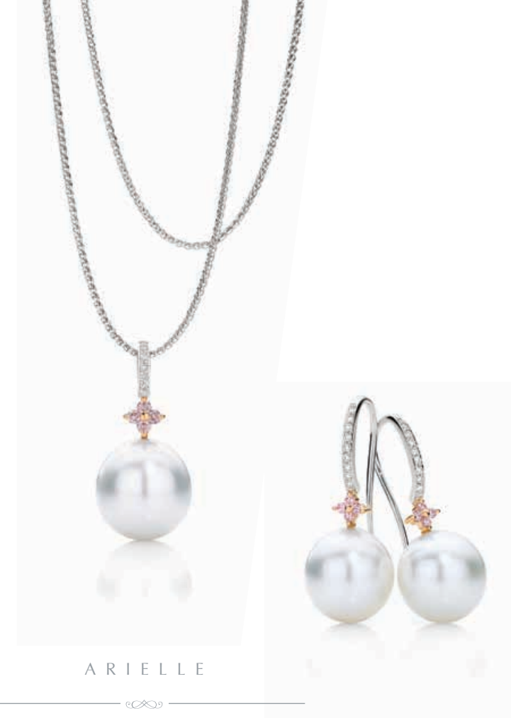
A R I E L L E

A pair of magnificent Platinum Pink and White Diamond South Sea Pearl earrings, taking their inspiration from the exoticism of Oriental Imperialistic design. An elaborate scroll forms the delicate backdrop for a pair of lustrous creamy white South Sea Pearls, offset by rare Pink Argyle Diamonds, creating the ultimate expression of femininity.