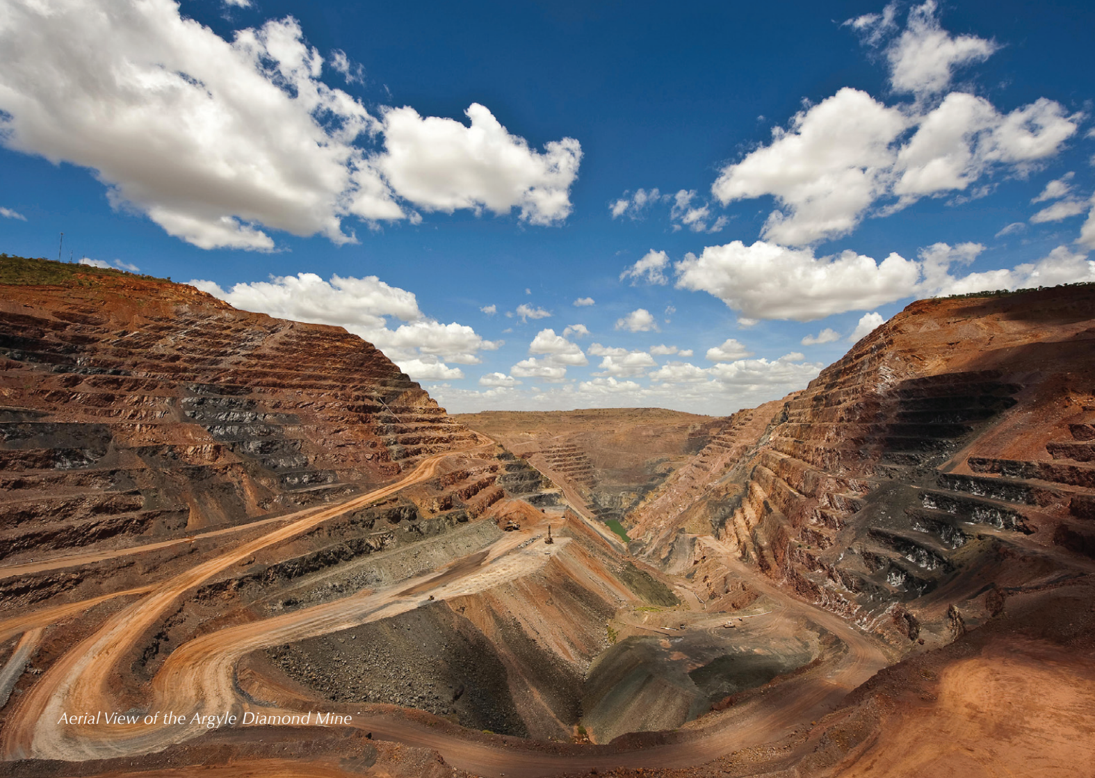
Aerial View of the Argyle Diamond Mine

The beginnings of this new diamond mine presented some tough challenges.